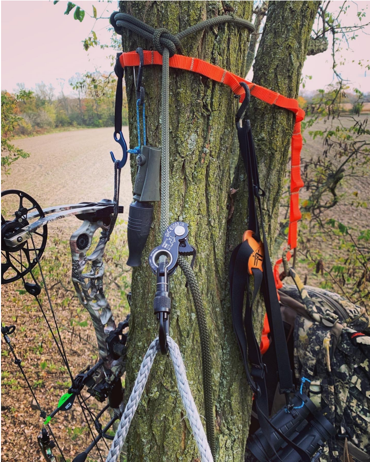
Loop with a girth hitch